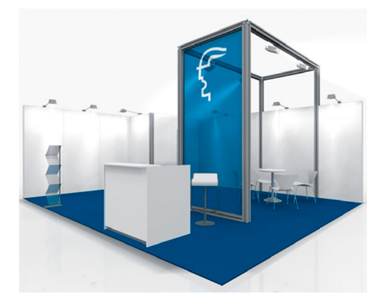
Modular Stand Type C including extra furnishings

** 20 m<sup>2</sup> Row stand, One-Year Contract