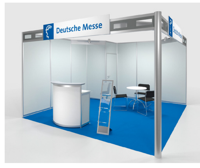
Modular Stand Type A including extended furnishings pack